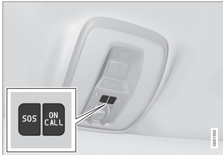
The Volvo On Call buttons

Volvo On Call is connected to the vehicle's airbag and alarm systems. The vehicle has an integrated Global System for Mobile Communications (GSM) module that handles communication between the vehicle and the Volvo On Call customer service center.