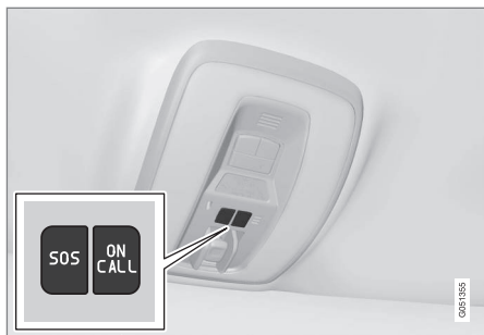
The Volvo On Call buttons

Volvo On Call is connected to the vehicle's airbag and alarm systems. The vehicle has an integrated Global System for Mobile Communications (GSM) module that handles communication between the vehicle and the Volvo On Call customer service center.