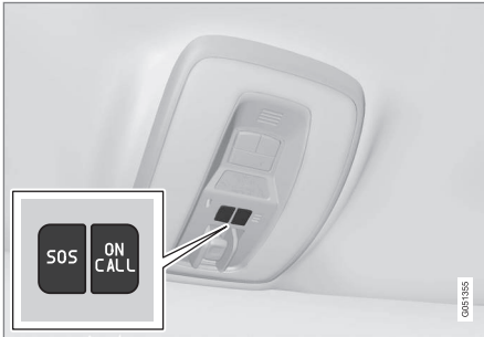
The Volvo On Call buttons

VOC is connected to the vehicle's airbag and alarm systems. The vehicle has an integrated Global System for Mobile Communications (GSM) module that handles communication between the vehicle and the VOC customer service center.